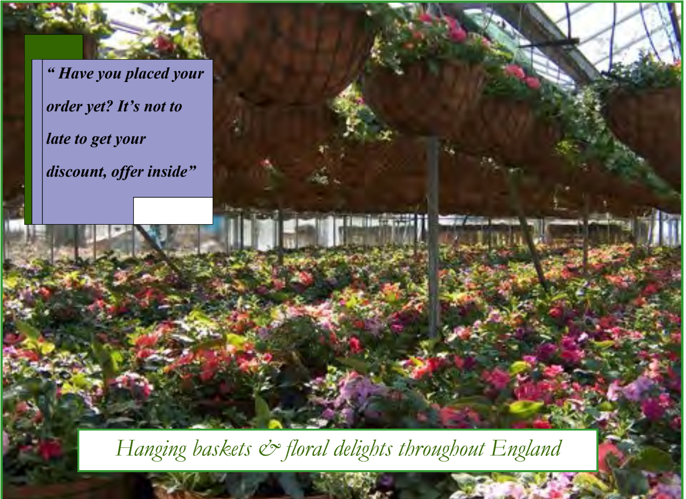
Hanging baskets & floral delights throughout England

“ Have you placed your order yet? It's not to late to get your discount, offer inside”